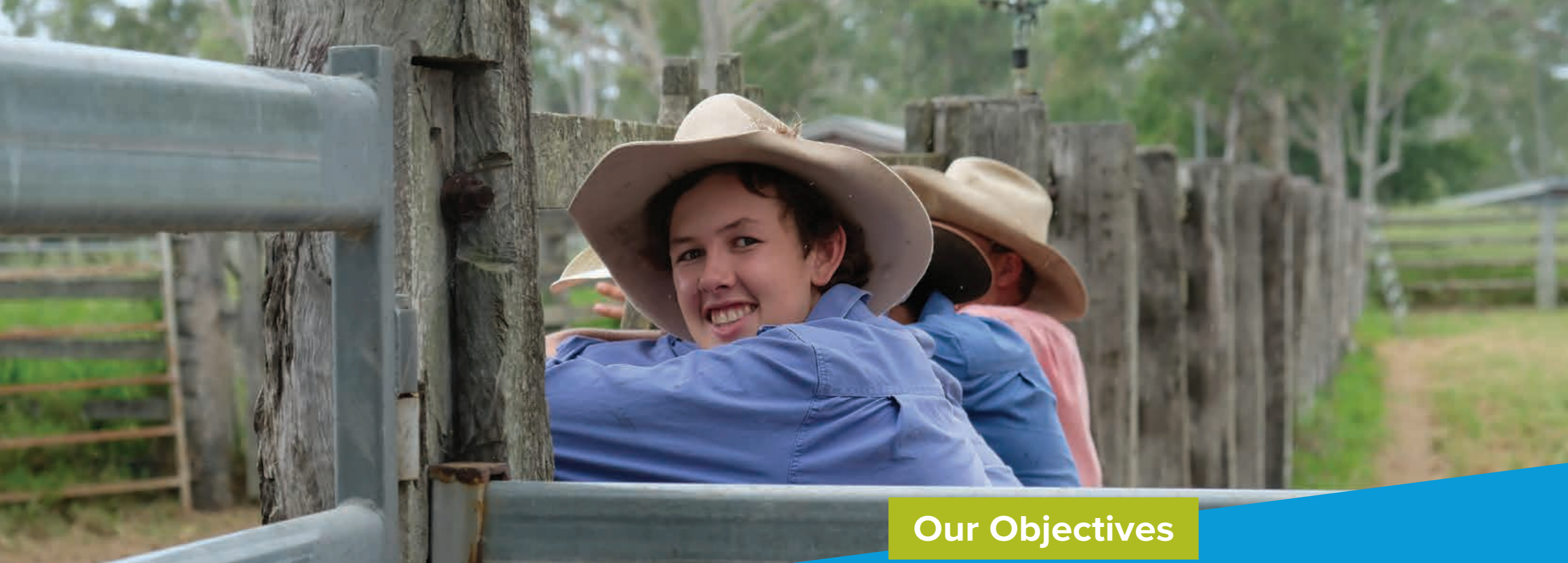
ABOVE: Students at PIEFA Member School Rockhampton Grammar School on their school farm