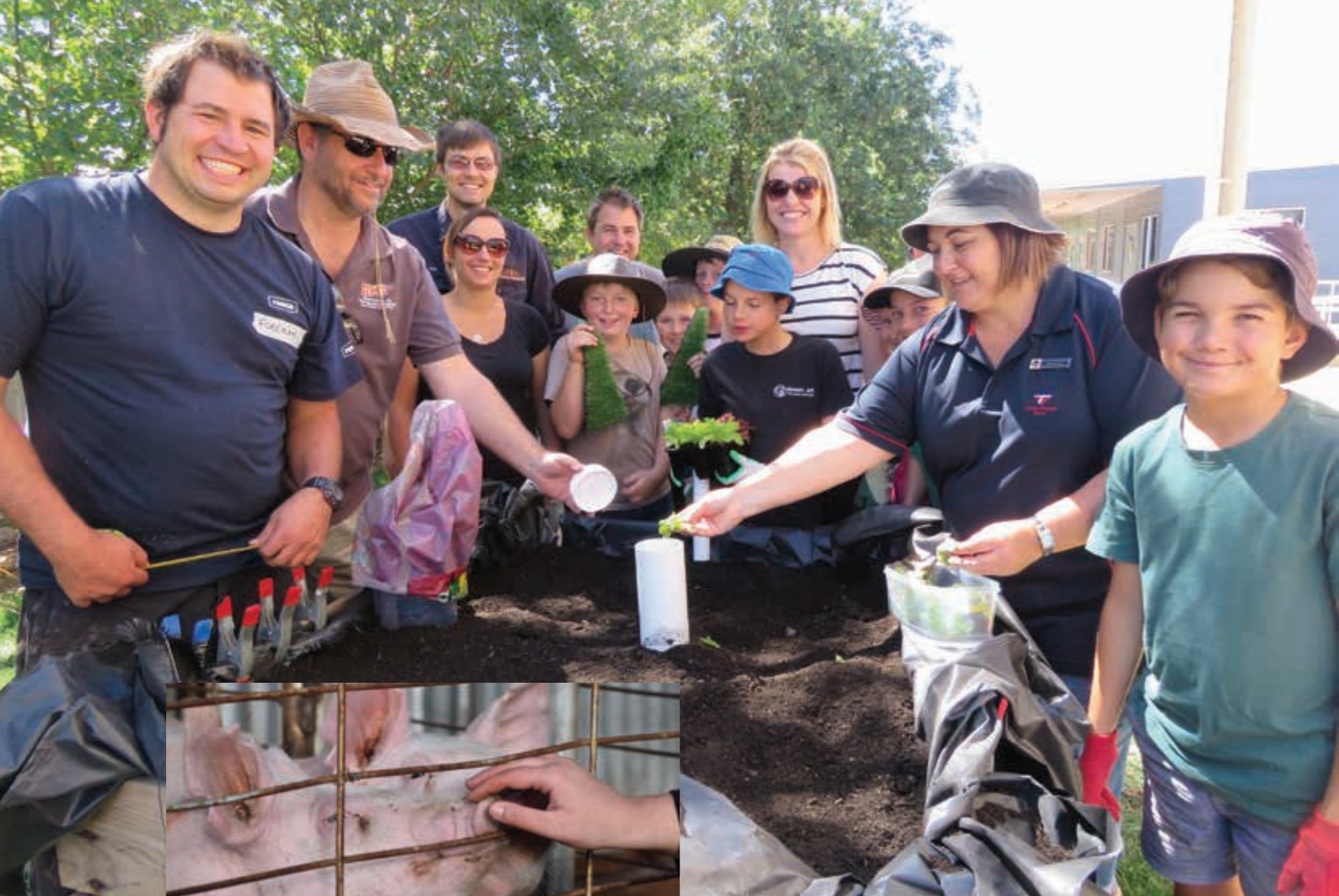
ABOVE: Students and staff at PIEFA member school Orange Christian School, at their wicking garden.