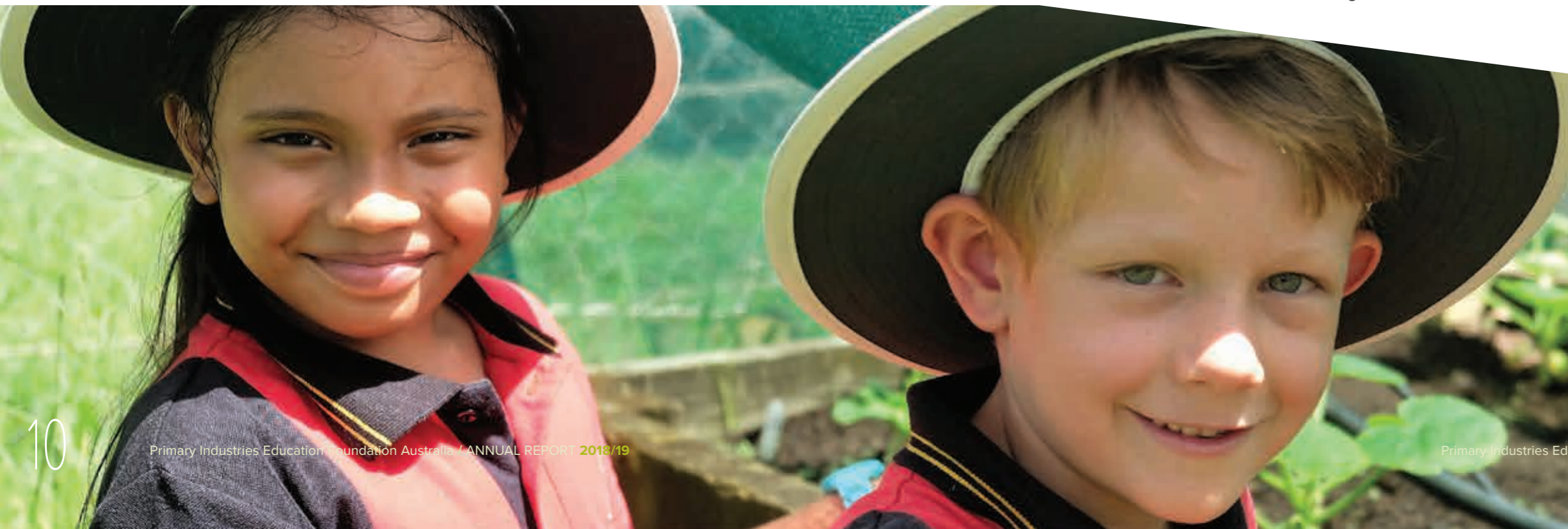
LEFT: Students at PIEFA member school Rockhampton Grammar school tend their school vegetable garden.