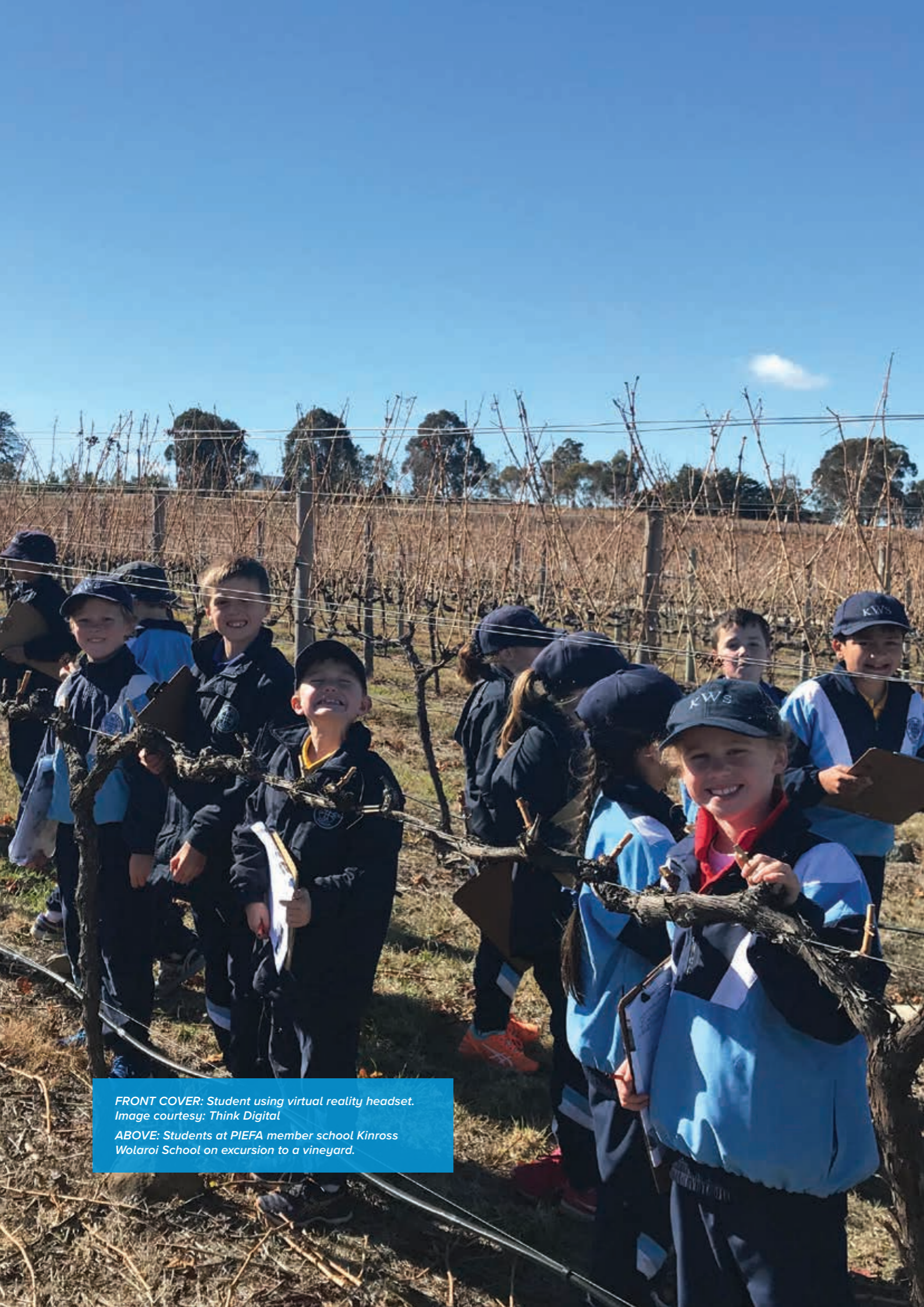
FRONT COVER: Student using virtual reality headset.